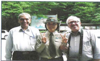
Delegates of the 3 rd ACRR at Beijing, P.R.China